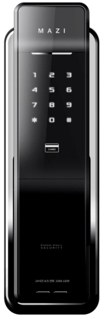
All in one main door lock